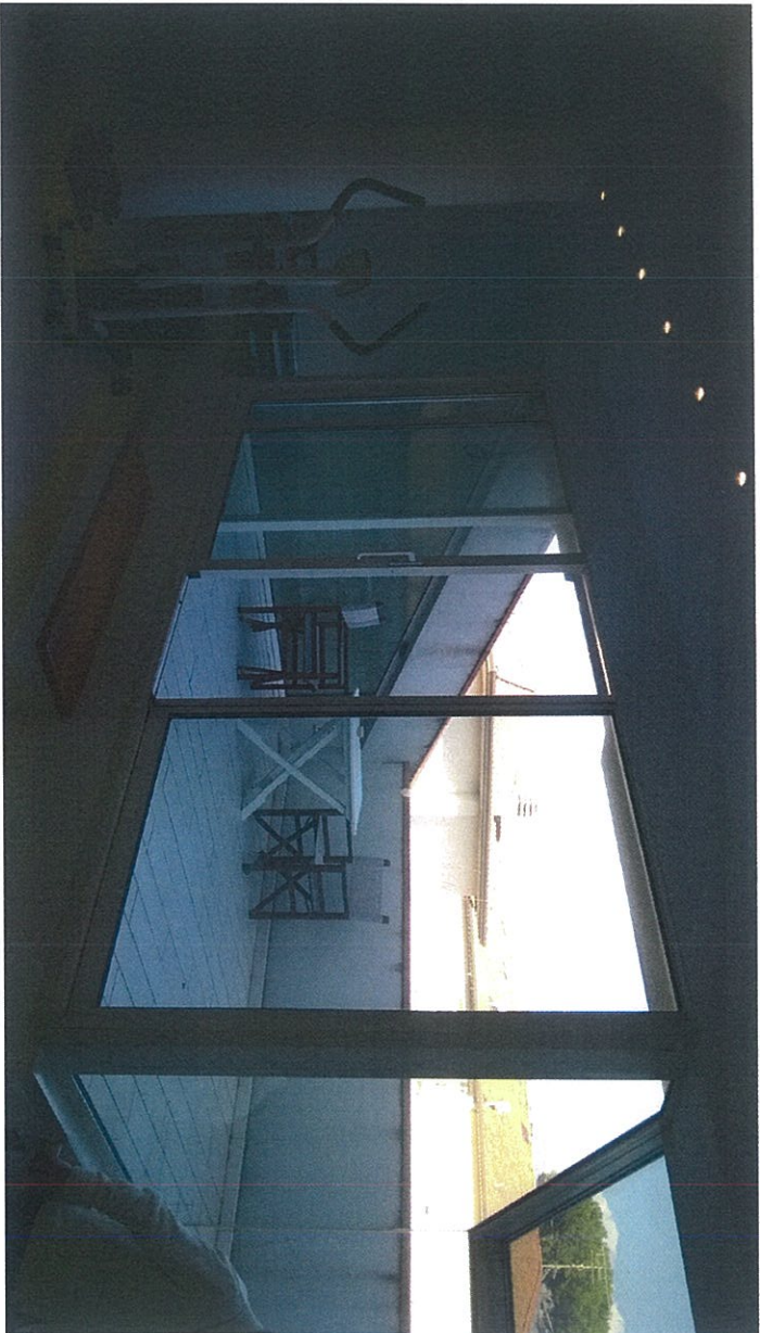
07 mansarda e terrazzo a vasca