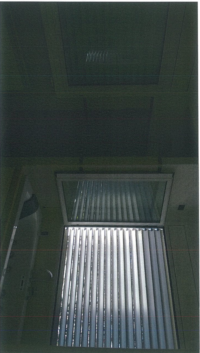
06 Bagno a servizio camera padronale