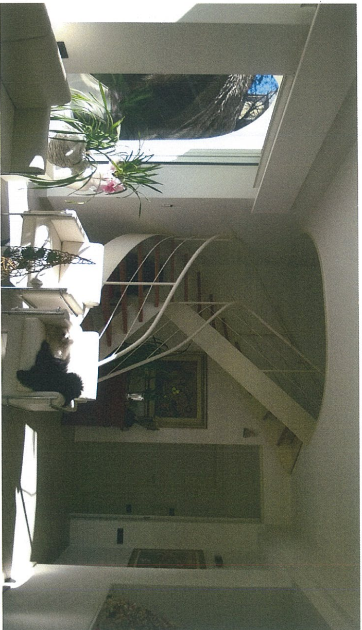
03 Soggiorno (scala di accesso al piano primo)