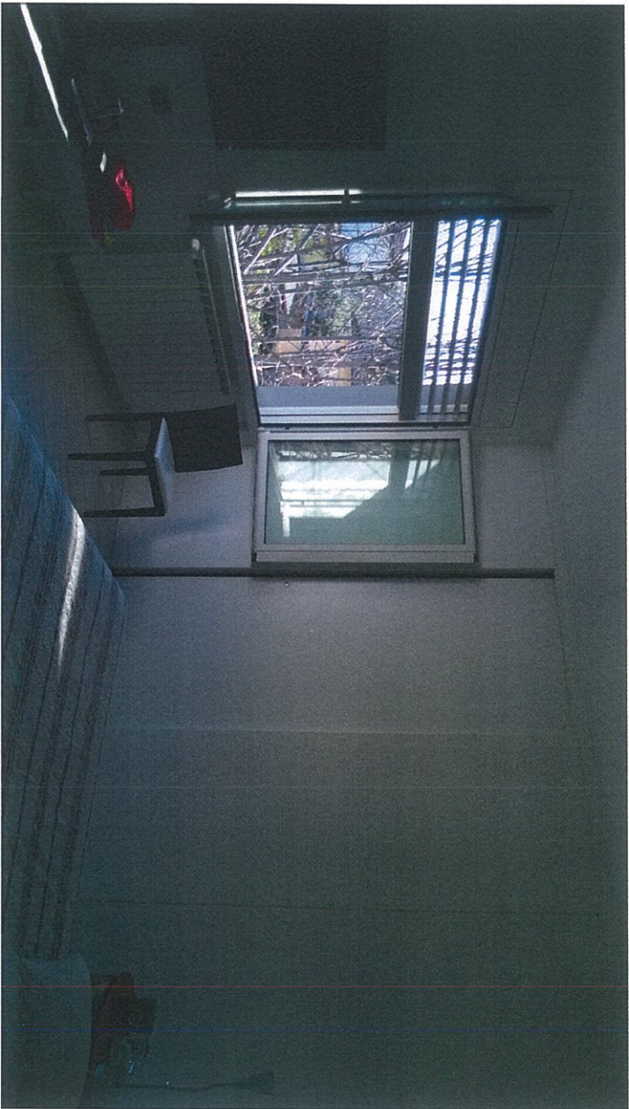
08 Camera padronale