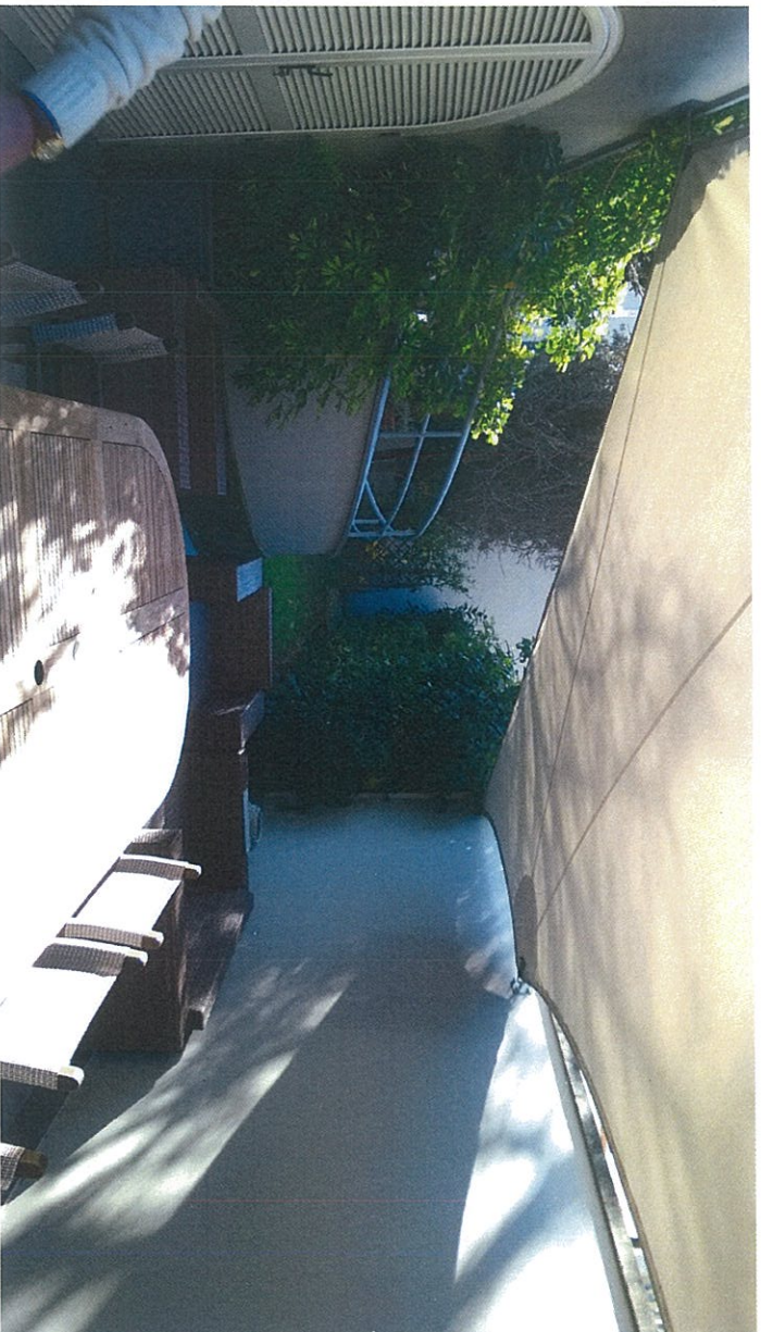
02 giardino lato nord