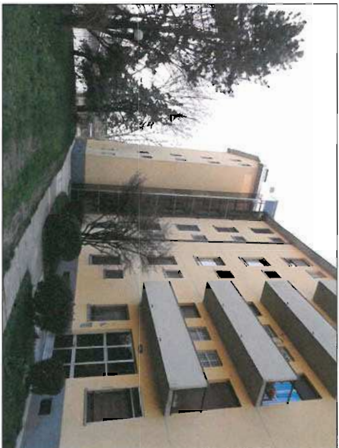
PROSPETTO SU CORTILE INTERNO