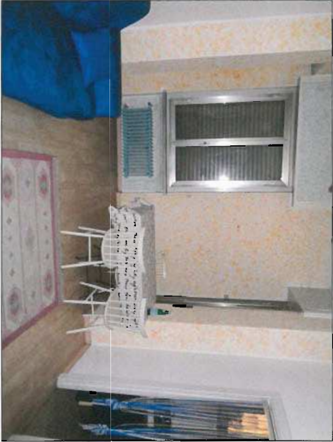
INGRESSO / DISIMPEGNO