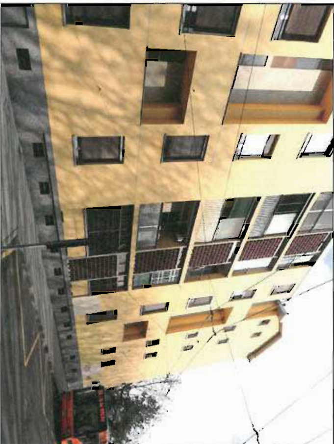
PROSPETTO SU VIA OMERO