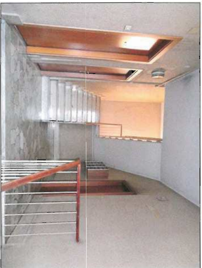
ATRIO SCALE PIANO RIALZATO