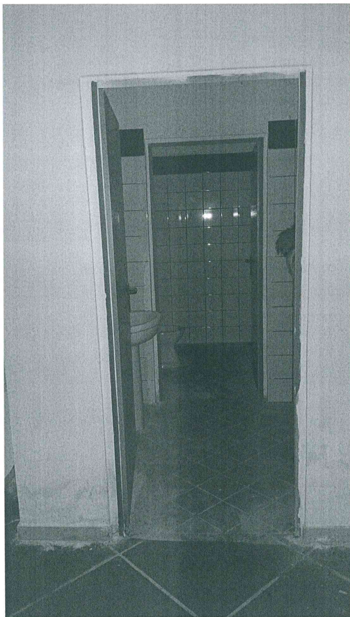
Foto 3 - Servizi igienici