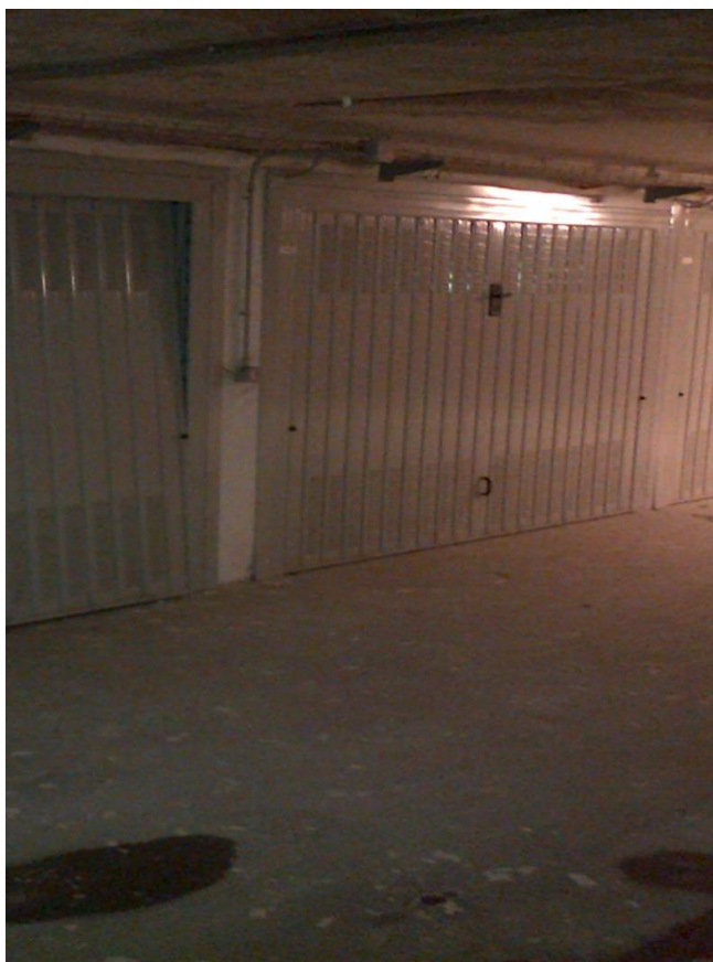
AUTORIMESSA (SUB 47)